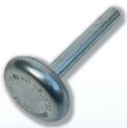
Large 50mm diameter steel roller for extra strength and long life.