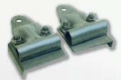
Stainless steel end hinge and roller carrier. Removable cap allows roller change without removing panels.