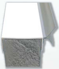
Dual durometer top seal for good thermal performance.