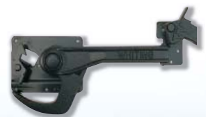
77 lock complete with keeper

A variety of lock systems are available.